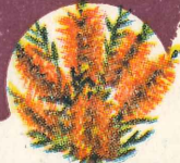
RED BOTTLE BRUSH QUEENSLAND