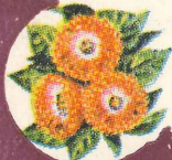
POHUTUKAWA NEW ZEALAND