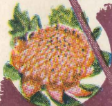
WARATAH NEW SOUTH WALES