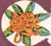
TASMANIAN WARATAH TASMANIA