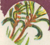
KANGAROO PAW WESTERN AUSTRALIA