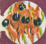
STURT PEA SOUTH AUSTRALIA