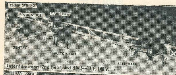
CHIEF SPRING FINDON JOE CARL BAR GENTRY WATCHMAN FREE HALL

Interdominion (2nd heat, 2nd div.)—11 f. 140 y.