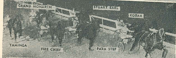
PAY LOAD GRAND MONARCH SYUARY EARL KODAK TAMINGA FIRE CHIEF PARA STEP

Interdominion (2nd heat, 3rd div.)—11 f. 140 y.