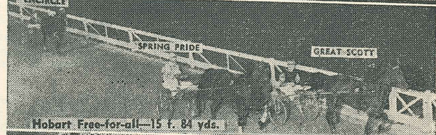
SPRING PRIDE GREAT SCOTT