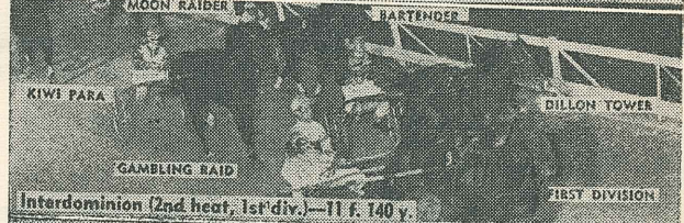
MOON RAIDER BARTENDER KIWI PARA DILLON TOWER GAMBLING RAID FIRST DIVISION

Interdominion (2nd heat, 1st div.)—11 f. 140 y.