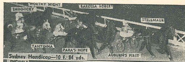
WORTHY NIGHT BAROSSA ROBERT SHINNICKY STELLMAUR TANYINNA PARA'S HOPE AUBURN'S FIRST