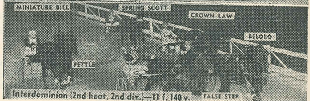
MINIATURE BILL SPRING SCOTT CROWN LAW BELORO FETTLER

Interdominion (2nd heat, 1st div.)—11 f. 140 y.