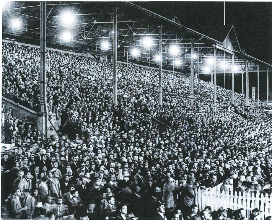
INTEREST: A record crowd of more than 47,000 watches the Inter Dominion trotting championship at Wayville in 1963.